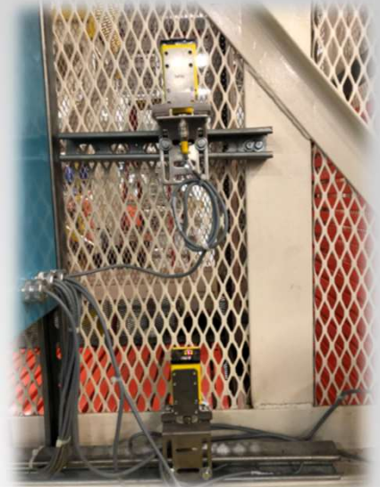
Multiple photo eyes positioned on Esconveyor