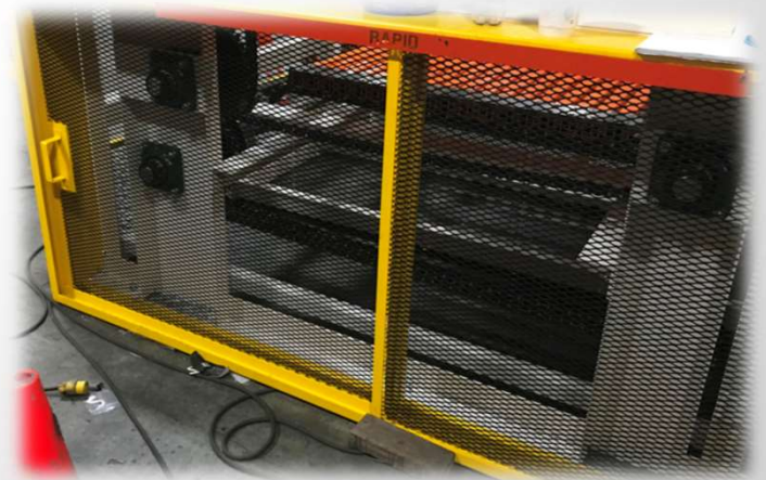
Sliding Access Guards with Safety Locks & Black Expanded Metal for Improved Viewing