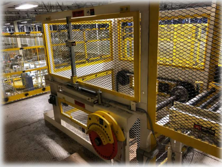
Mechanical Brake Assembly, used when performing maintenance, pinned & placed in alignment hole