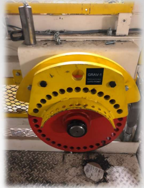
Mechanical Brakes provided with tab for LOTO when performing maintenance