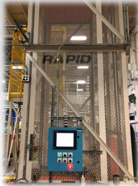
HMI located at floor level for easy operator access