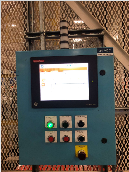
Remote HMI for local control through the Mainline PLC