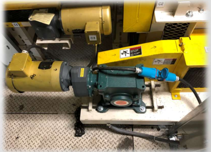
Meltric quick change plugs and dual chain guards, resulting in minimal downtime