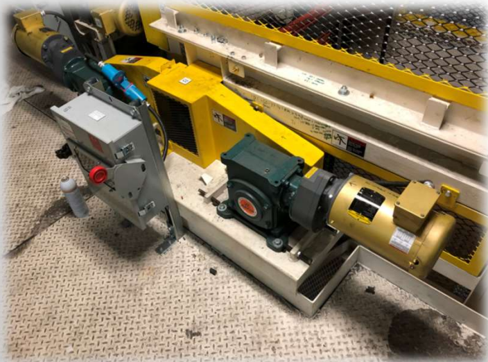
Dual drive system to prevent downtime in the event of a motor failure